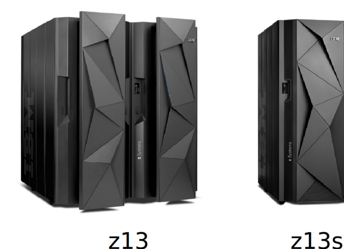
FIGURE 1. IBM z13 and z13s

The release of the IBM z13s (2016) marks the latest in the family of z models. The z13s is a highly scalable symmetric multiprocessor (SMP) system incorporating the advanced technologies announced with IBM z13 in 2015 in a much smaller single cabinet footprint.